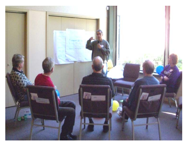
Unity of Panama City

Most ministries will have between three and five core values. This keeps the focus on how each person and the ministry is "to be" as they do their shared activities. This calls for more definition to ensure a shared understanding and to serve as a guide.