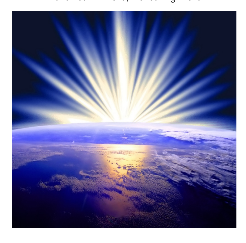
Creation: The original plan of an idea in Spirit. Charles Fillmore, Revealing Word

For step 3, we strongly encourage you to have a trainer facilitator (Unity Worldwide Ministries' Ministry Skills Team or a local professional) who will choose the approach.