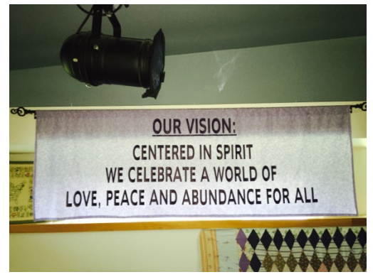
Unity of North Idaho