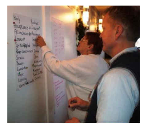
Unity of Toledo