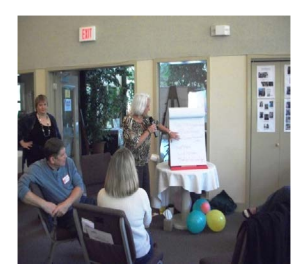
Unity of Panama City

Please note: Several ways of creating core values have evolved within the Unity movement. The Unity Worldwide Ministries Ministry Skills Team, in its work with over one-hundred Unity ministries, has found that simplifying the process by not including the rationale and by using the word "behaviors" rather than "actions" is easily understood and worked with by Unity ministries and achieves the purpose of core values.