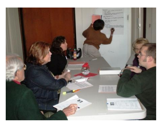
Unity of Toledo

You might want to consider aligning your vision with the larger Unity vision of, "A world powerfully transformed through the growing movement of shared spiritual awakening." If your ministry already has a vision statement, you may wish to review it and consider aligning it with the larger Unity vision.