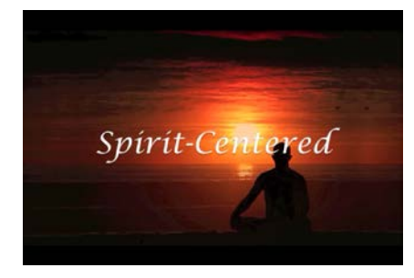
Unity of Panama City