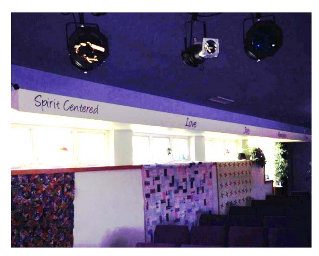
Unity Spiritual Center of North Idaho